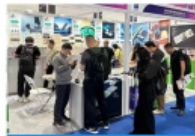
Guangzhou International Electronics